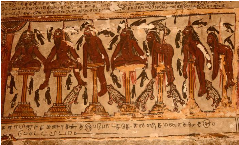
Mural on the ceiling of Avudaiyar Koil at Pudukottai District showing the impalement. Mural also depicts Crows and other unidentified animals feeding on impaled corpses.