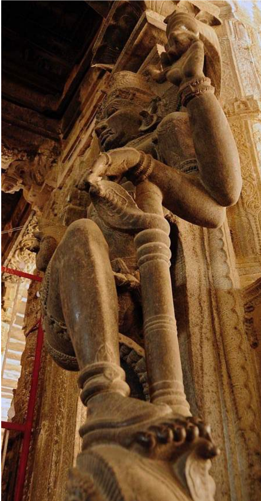
Sculpture view in Avudayar Kovil. Photo by Ravindraboopathi. Licensed under CC BY-SA 3.0.