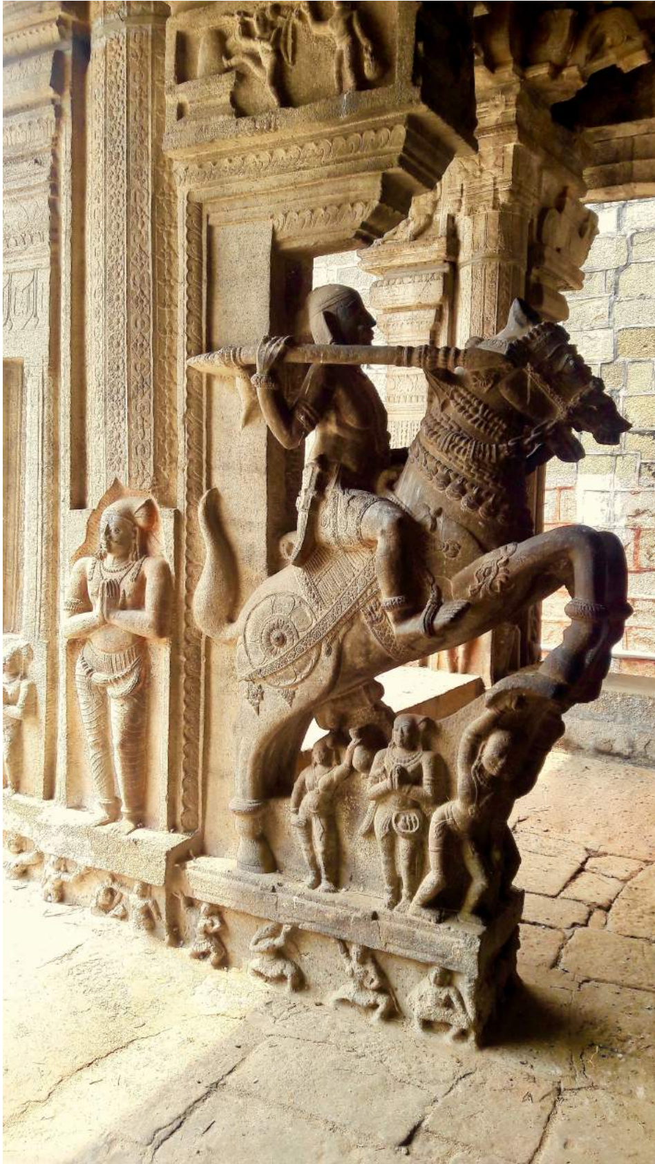
Athmanatha Swamy Temple Avudayarkoil