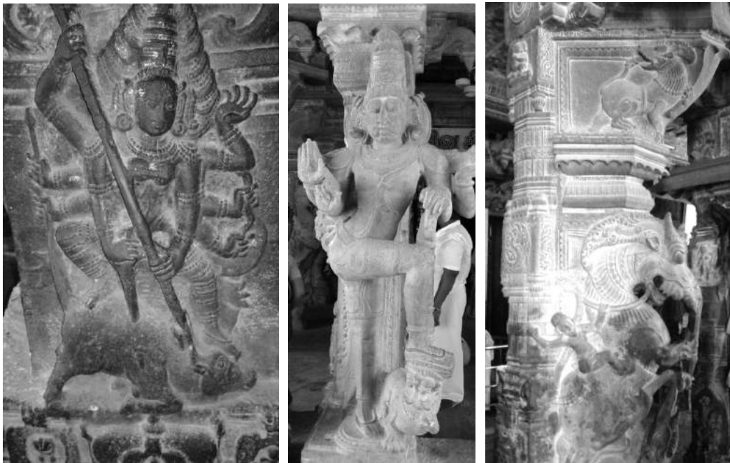
Figures: 4. Mahishamardini; 5. Dwarapalakas; 6. Yali in Pillar

In Hindu temples, different animals or creatures have been used, which is sometimes thought to be a guard at the gate of the temple. The Yali has been made of the different structure and body parts and in some cases, it looks like a body of cat and head and face of a lion and the nose of the elephant and the tail is sometimes look like almost all of the structure is made a 3D model. Yali is considered a sacred animal which is very dangerous in look so makes it powerful and it is made using the body parts of other animals like lion, elephant, snake, etc. Yali has been an integrated part of the pillar in Indian history because of their carving on the pillars. The power of Yali is considered to be so much more than the lion and the elephant. They have always increased the beauty and art of the pillar (Fig. 6).