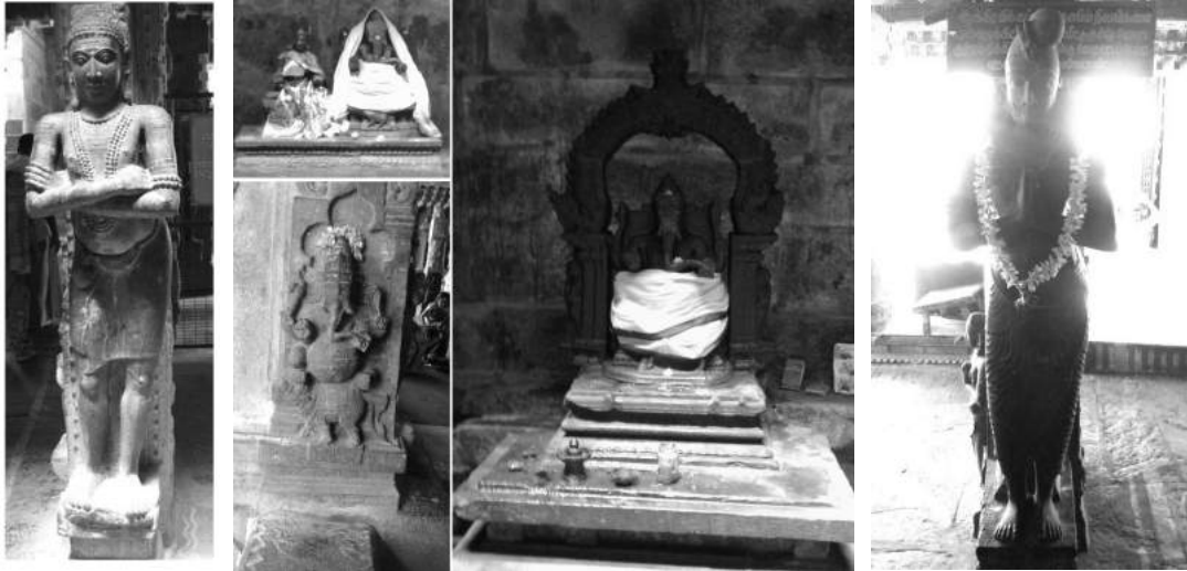
Figures: 1. Manickavasakar. 2. Vinayaka sculpture. 3. Varagunavarman II Pandiya King