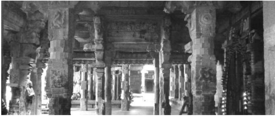
Figure 10: Mukhamandapa

In front of the Garbhagrha and contiguous to it is the Mukhamandapa, sometimes called Sukanasi or Ardhamantapa, depending upon its proportion relative to that of the Garbhagrha. Apart from being used as a passage, it is also used to keep the articles of worship including Naivedya (food offerings) on special occasions. There 16 different pillars such as Yail pillar, horse (Fig.10).