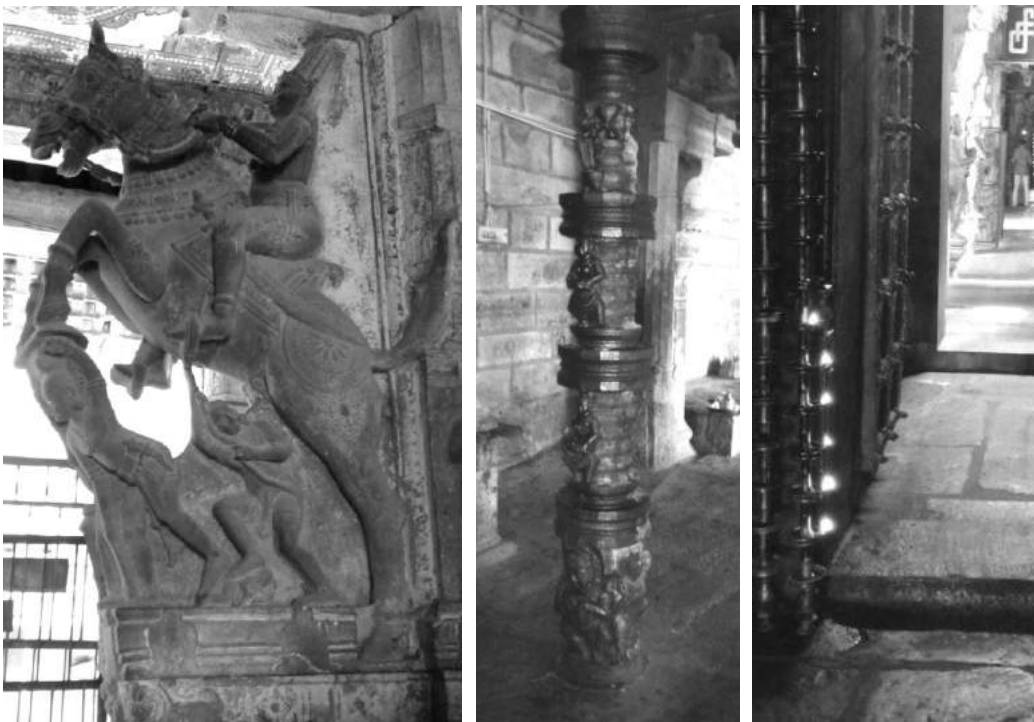
Figures: 7. Pillars with Horse; 8. Pillars with lamp; 9. Garbhagrha

"The most important part of a temple, its very heart as it were, is the Garbhagrha or sanctum." 8 That is square with a low roof and with no doors or windows except for the front opening. The image of the deity is stationed in the geometrical Centre. The whole place is completely dark, except for the light that comes through the front opening. Over the roof of the whole shrine is a smaller tower. There are no images, iconic or anionic, in the sanctum. In the Shrine of the Lord, only a Pitha, is under worship (Fig.9).